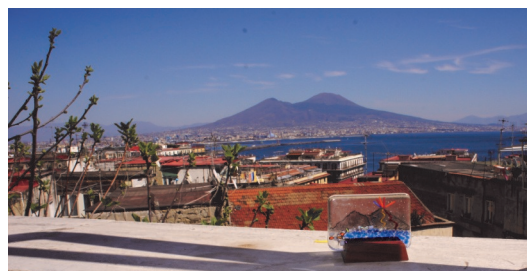
(Above: A beautiful view of Mount Vesuvius from The Schumacher's condo as well as an example of the beautiful hand-crafted glass gifts that The Schumacher's made as awards).