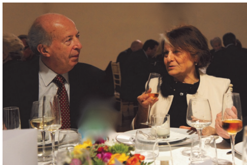
Above: Guests talk and enjoy dinner at the opening night reception.)